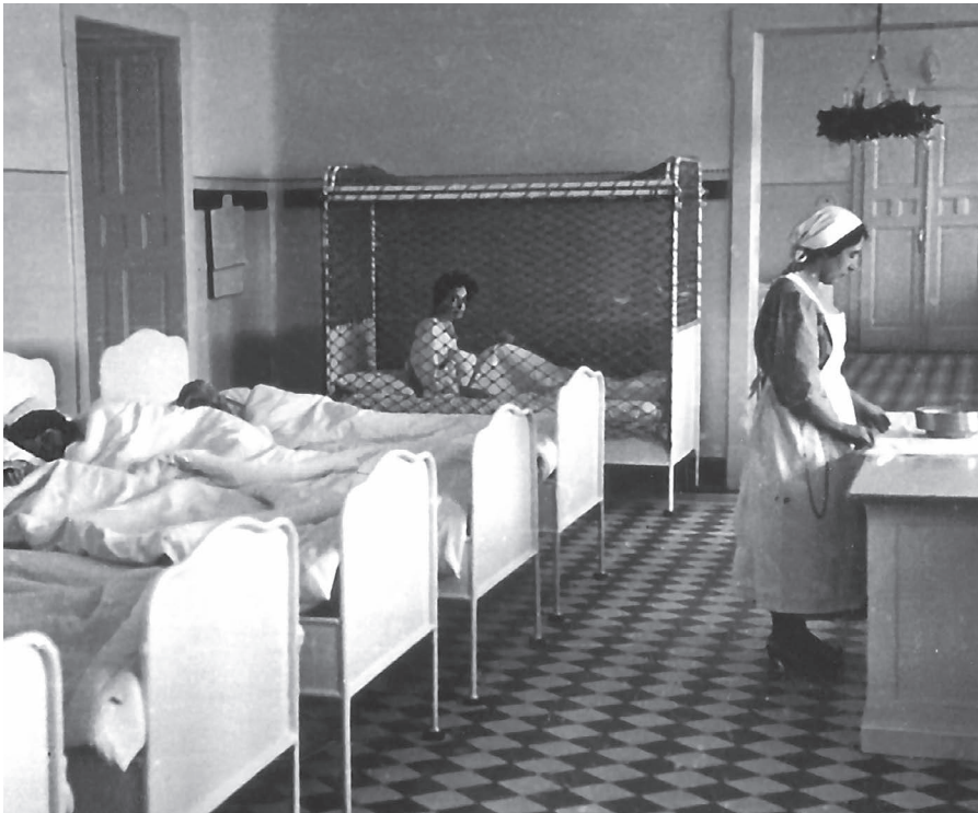
A ward in the Am Spiegelgrund clinic in Vienna, in the 1940s.